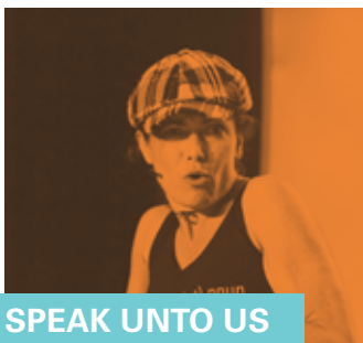
SPEAK UNTO US

—Policy director, national education advocacy organization