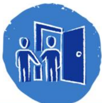
POSITIVE & INVITING SCHOOL CLIMATE